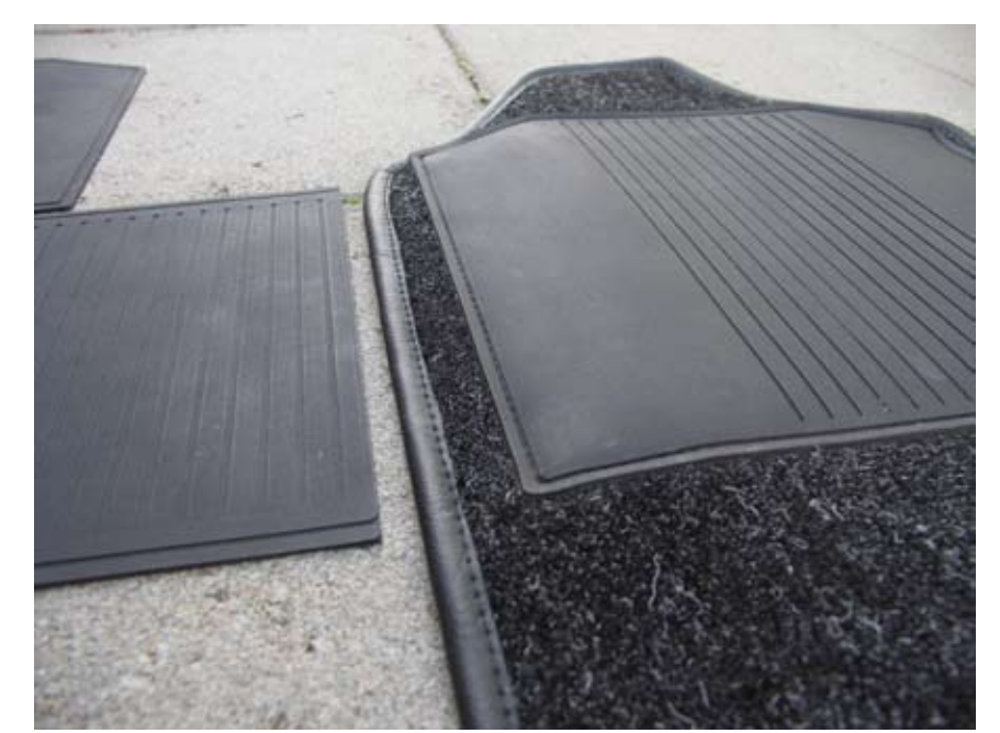
Close-up pictures of centre-tunnel mat.