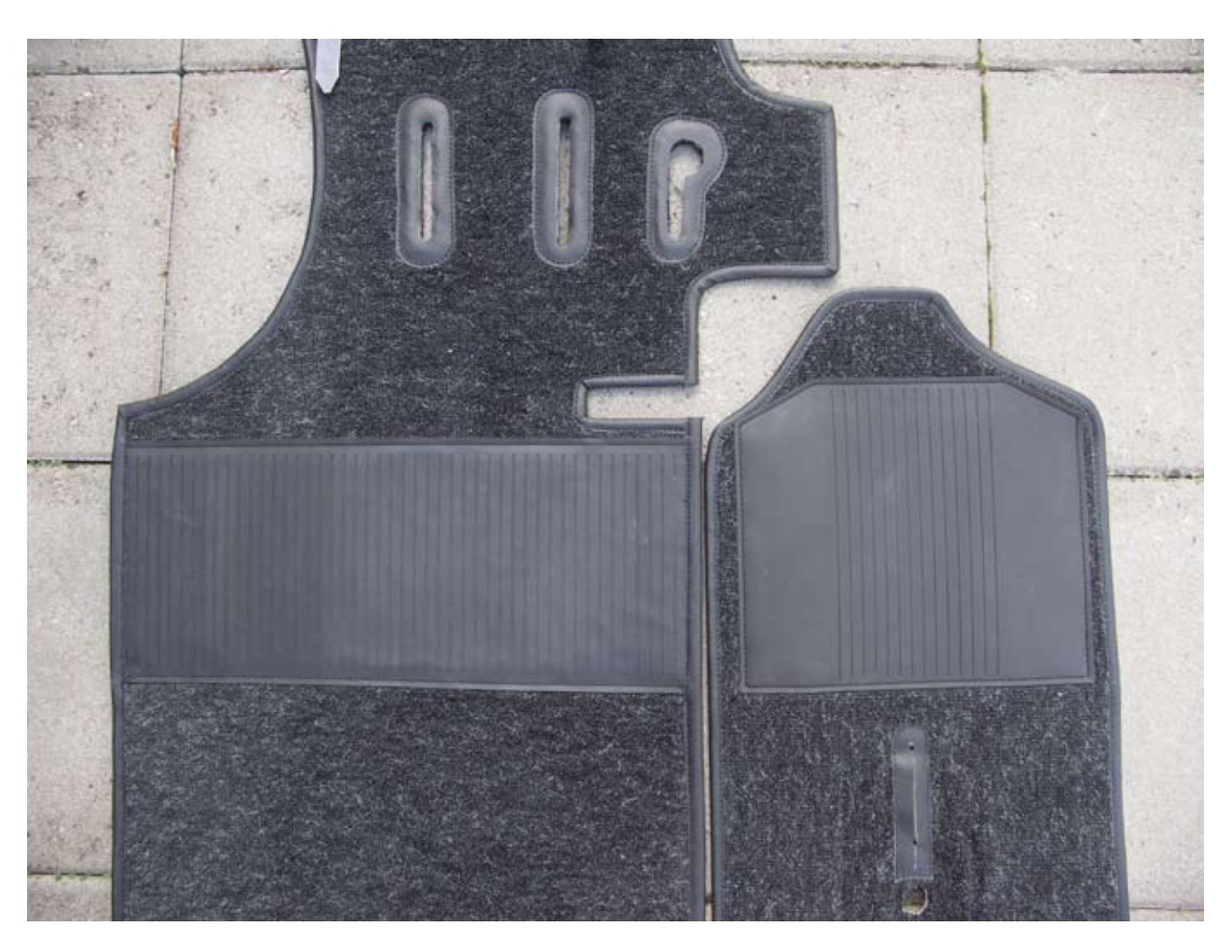
The pictures shows both mats - for left hand drivers and for "centre-tunnel" on charcoal velour.

They are copies of my original mats. See below!